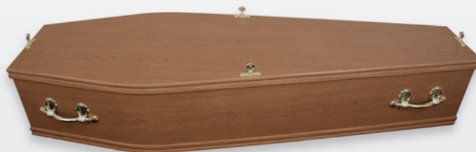
Wood effect coffin featuring flat lid and sides

We are here for you 24 hours a day 365 days a year