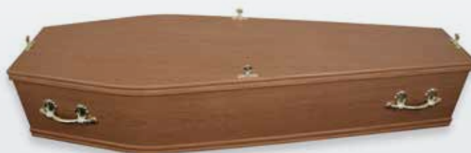
Wood effect coffin featuring flat lid and sides

We are here for you 24 hours a day 365 days a year