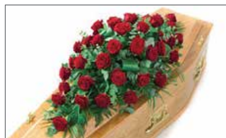
Floral Tributes - Rose Coffin Spray