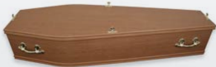
Wood effect coffin featuring flat lid and sides

We are here for you 24 hours a day 365 days a year