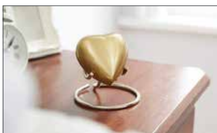
Memories - Heart Shaped Keepsake