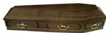
Derg African ayous wood with a matt finish.