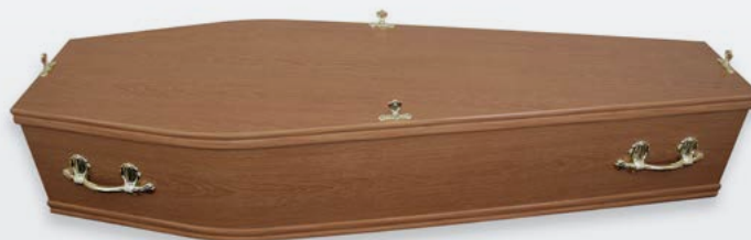
Wood effect coffin featuring flat lid and sides

We are here for you 24 hours a day 365 days a year