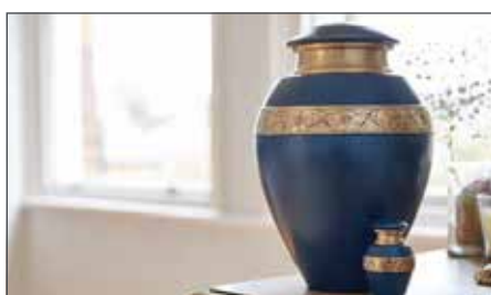
Memories - Anoka Urn