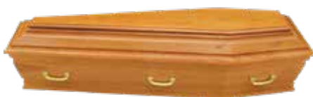
Bann European pine coffin with a satin finish.