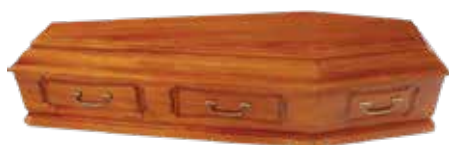
Lagan South American kiri wood coffin with a gloss finish.